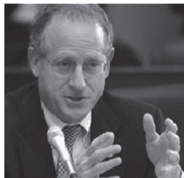
Congressman Mike Conaway

Conaway was treated to a gift basket of items from the Soap Shop and Machacek's Bakery and Market.