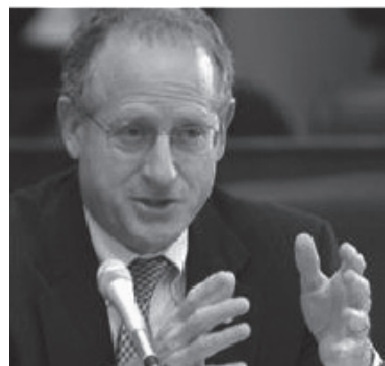
Congressman Mike Conaway

Conaway was treated to a gift basket of items from the Soap Shop and Machacek's Bakery and Market.